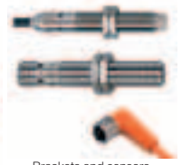
Brackets and sensors