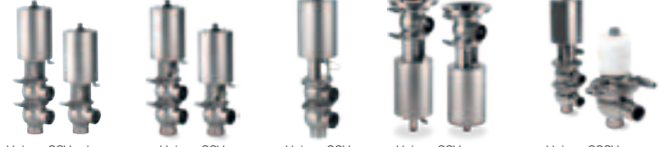
Unique SSV valve (standard configuration) Unique SSV aseptic valve Unique SSV ATEX Unique SSV tank outlet valve Unique SSSV small single-seat valve