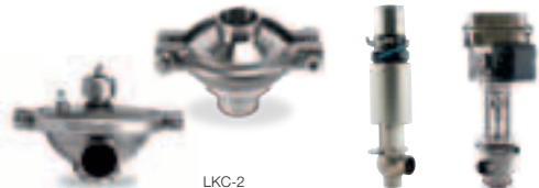
CPM-2 valve LKC-2 non-return valve Unique RV-ST SPC-2 valve