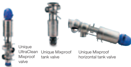
Unique UltraClean Mixproof valve Unique Mixproof tank valve Unique Mixproof horizontal tank valve